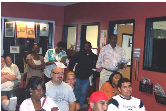
Cultural Center Attendees