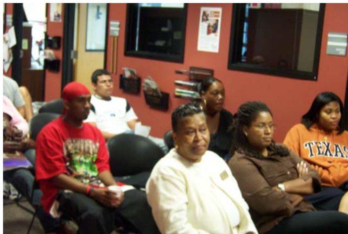
Cultural Center Attendees