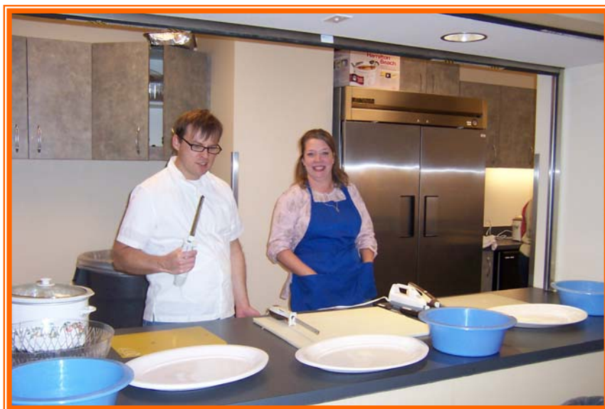
Suspiciously eager to carve the turkey!