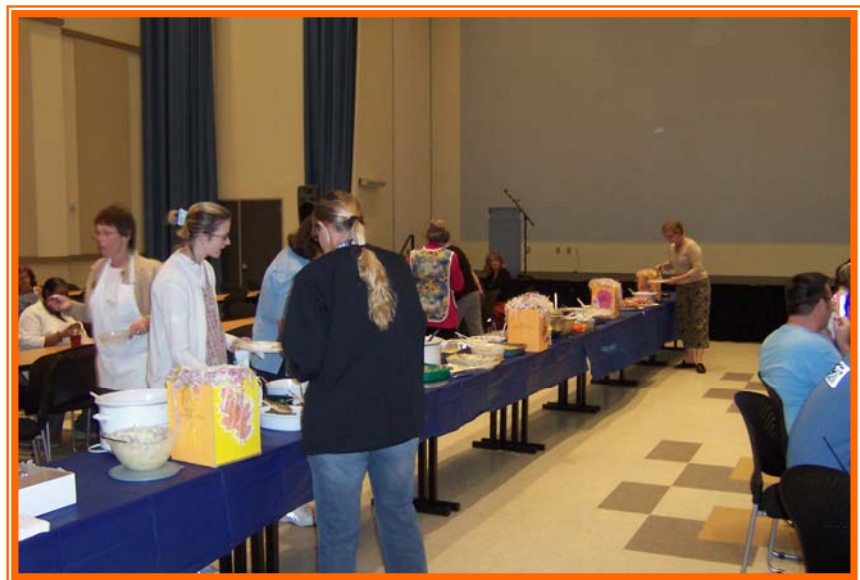
Faculty and Staff prepare their dishes