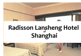
Radisson Lansheng Hotel Shanghai