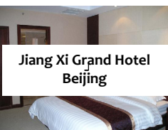
Jiang Xi Grand Hotel Beijing

Stay in 4-star hotels throughout the tour! Participants will share a room with another ACC student.