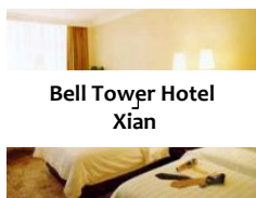
Bell Tower Hotel Xian