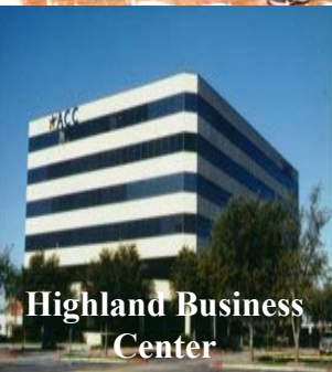
Highland Business Center